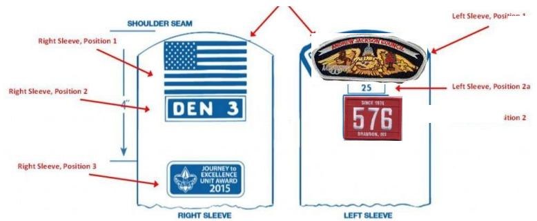
Diagram created by Cub Scout Ideas.