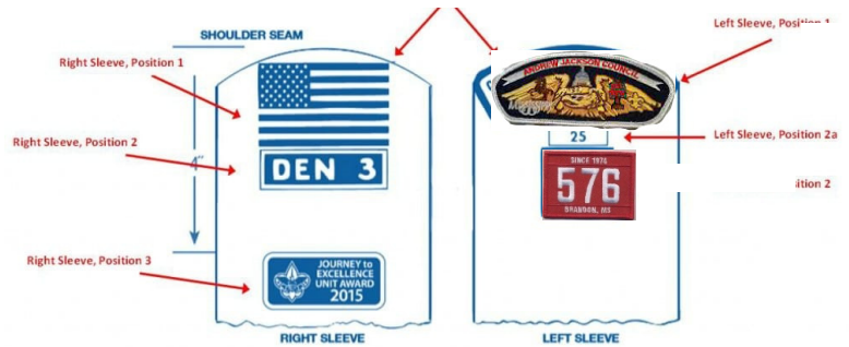
Image courtesy of Boy Scouts of America. Diagram created by Cub Scout Ideas.